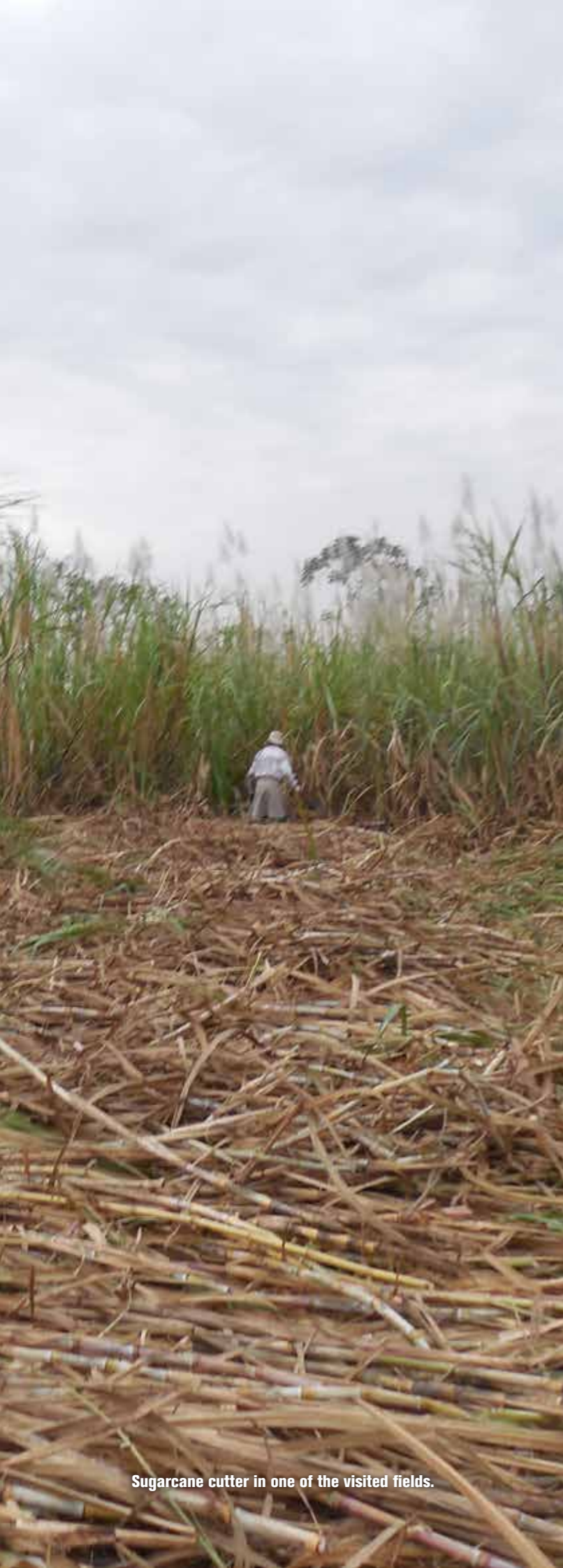
Sugarcane cutter in one of the visited fields.