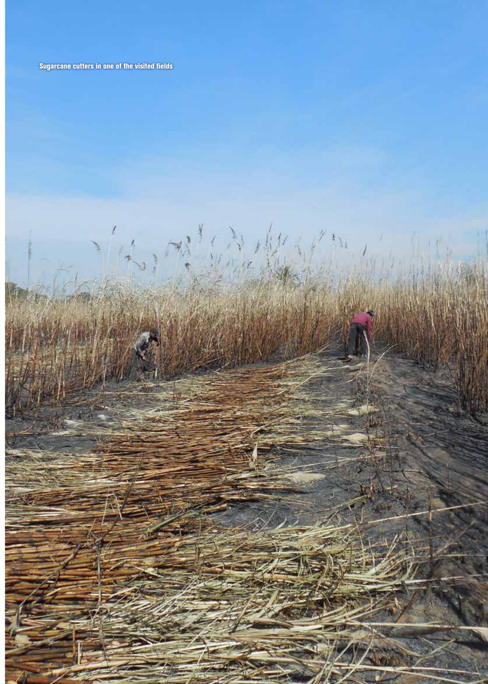
Sugarcane cutters in one of the visited fields

From that moment on, they worked in the development of the Free of Child Labor, Free of Discrimination and Free of Forced Labor standards (Triple Seal - Triple Sello), by involving prestigious organizations such as United Nations International Children’s Emergency Fund (UNICEF), International Labor Organization (ILO), the Bolivian Government (through its Ministry of Labor), the Institute for Standardization of Bolivia (IBNORCA) and other private organizations, with the outstanding participation of Mill A (an industry surveyed in this study, as part of the TCCC supply chain).