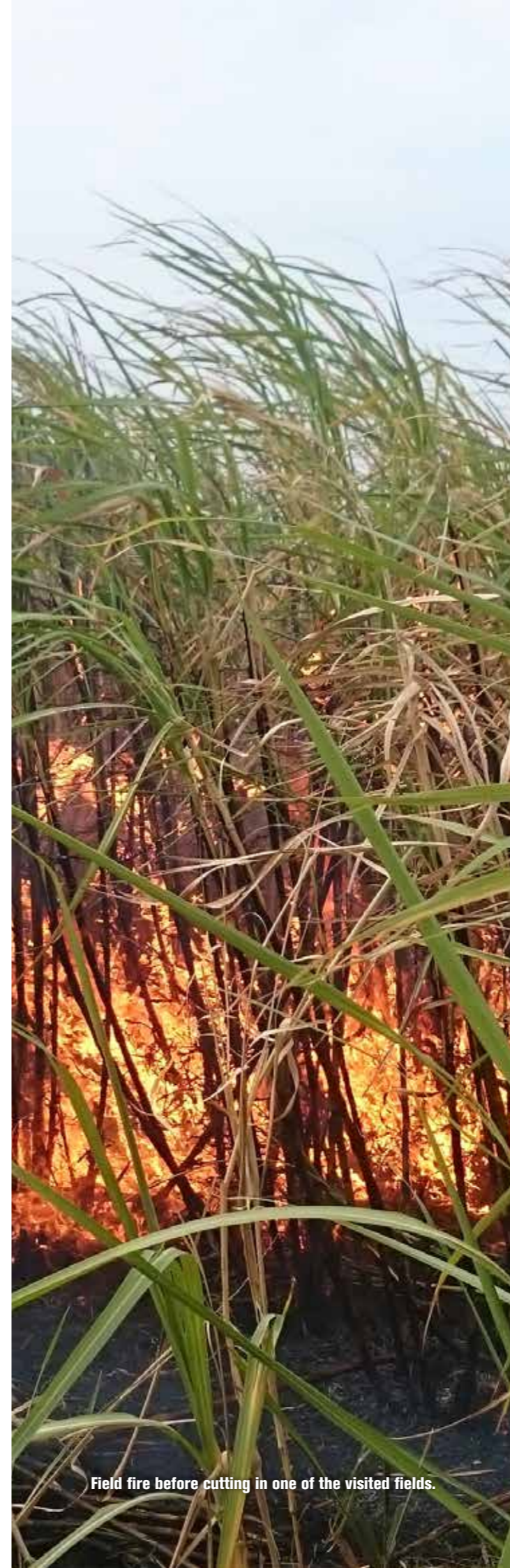
Field fire before cutting in one of the visited fields.

Other organizations have developed activities of containment, education and society protection regarding child and forced labor. Many of which had a strong presence in other areas or regions of the country, as well as in other productive activities where these problems occurred, and have not been specifically mentioned in this report.