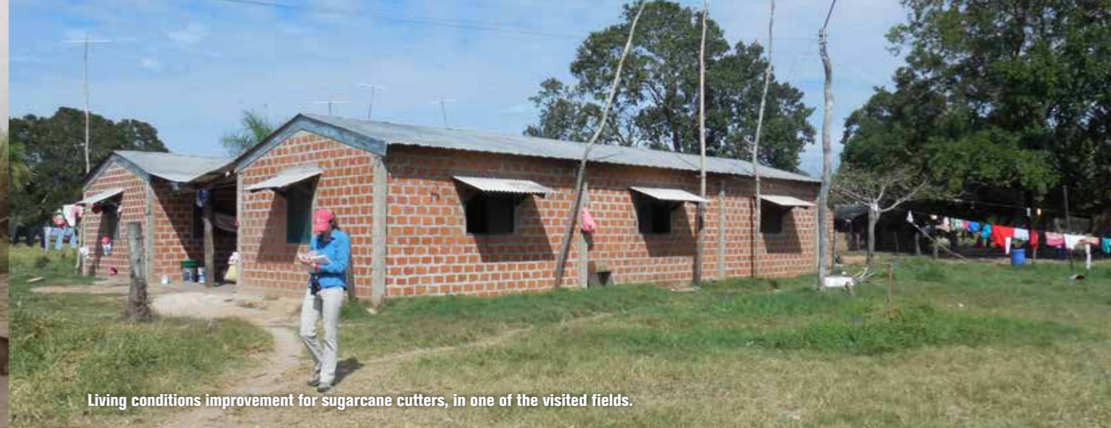
Living conditions improvement for sugarcane cutters, in one of the visited fields.

Worst Forms of Child Labor Convention, 1999 (No. 182) - [ratifications]: This fundamental convention defines as a "child" a person under 18 years of age. It requires ratifying states to eliminate the worst forms of child labor, including all forms of slavery or practices similar to slavery, such as the sale and trafficking of children, debt bondage and serfdom and forced or compulsory labor, including forced or compulsory recruitment of children for use in armed conflict; child prostitution and pornography; using children for illicit activities, in particular for the production and trafficking of drugs; and work which is likely to harm the health, safety or morals of children. The convention requires ratifying states to provide the necessary and appropriate direct assistance for the removal of children from the worst forms of child labor and for their rehabilitation and social integration. It also requires states to ensure access to free basic education and, wherever possible and appropriate, vocational training for children removed from the worst forms of child labor. 22 23