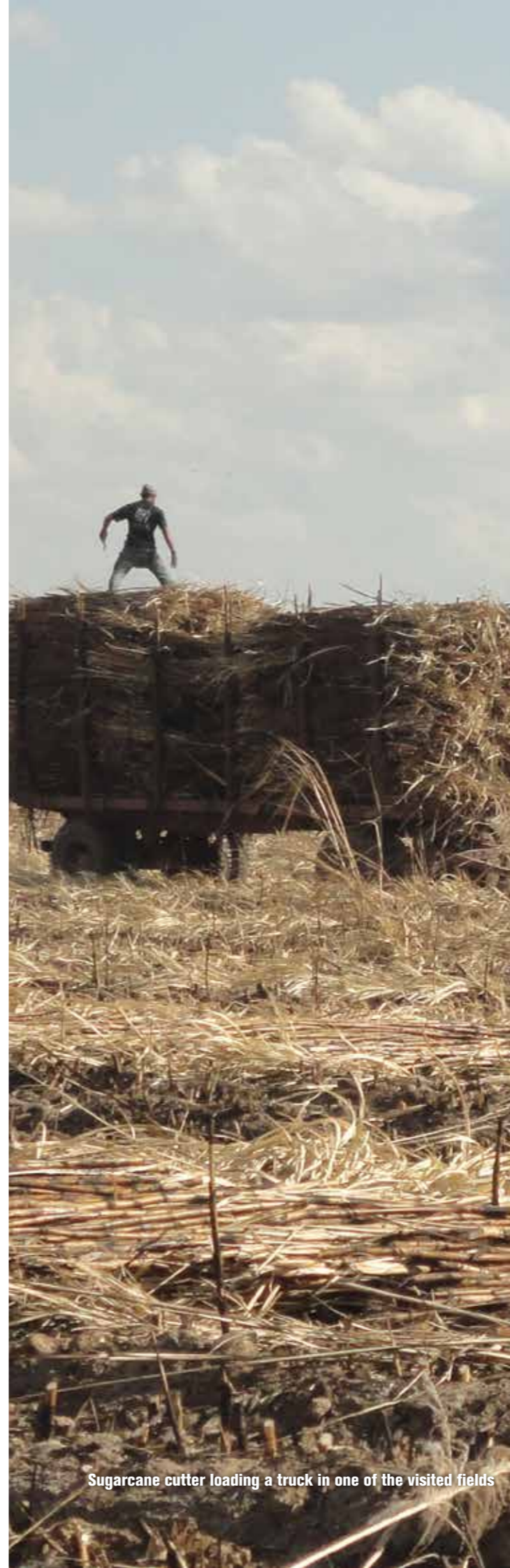
Sugarcane cutter loading a truck in one of the visited fields

In Mill B there was a situation three years ago (2013), when a group of people took illegal possession of a portion of one of its fields, claiming to have fundamental rights over it.