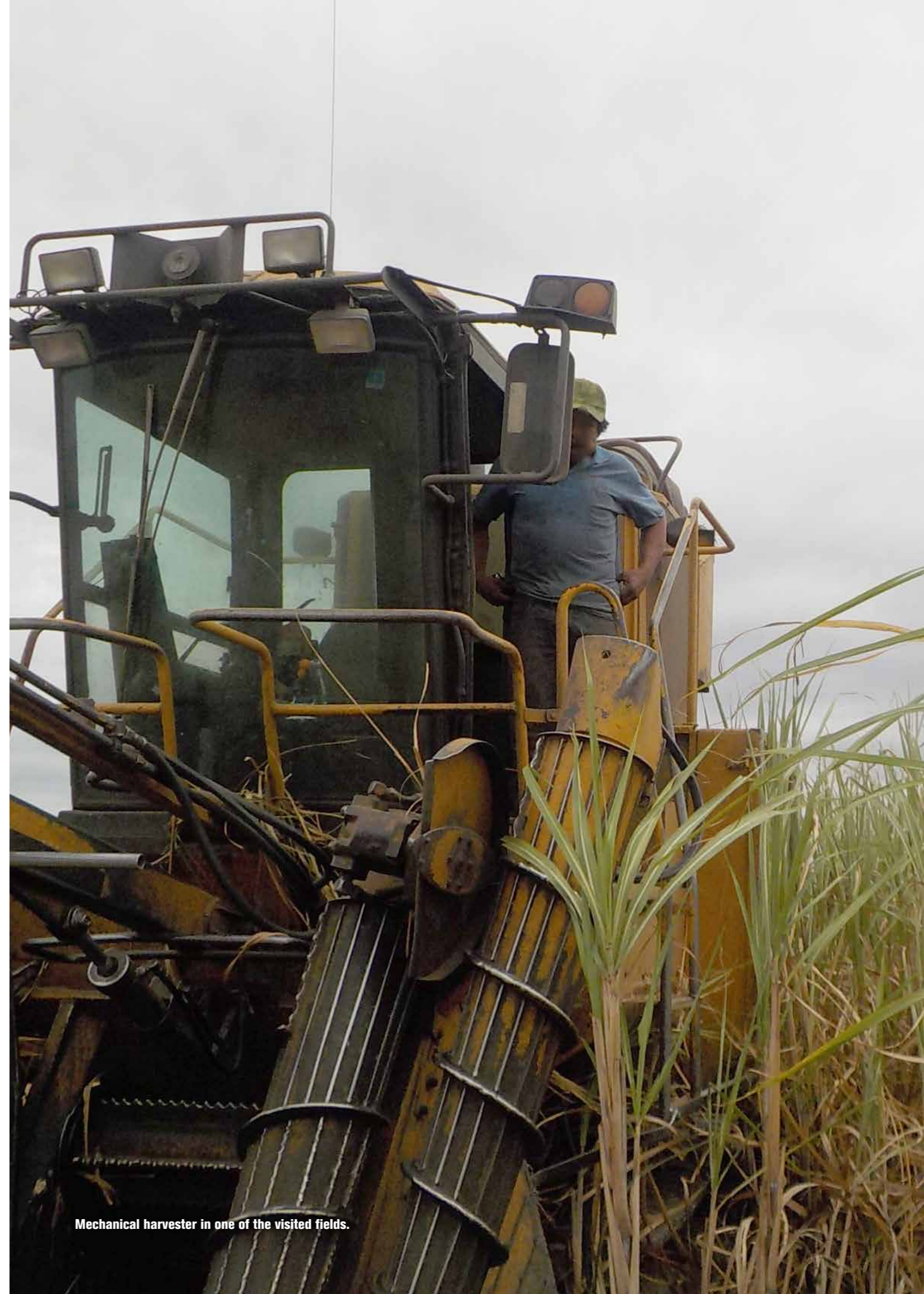
Mechanical harvester in one of the visited fields.

▪ Vicepresidencia del Estado. Presidente de la Asamblea Legislativa Plurinacional. 17/07/2014. Ley N° 548. Código Niña, Niño y Adolescente.