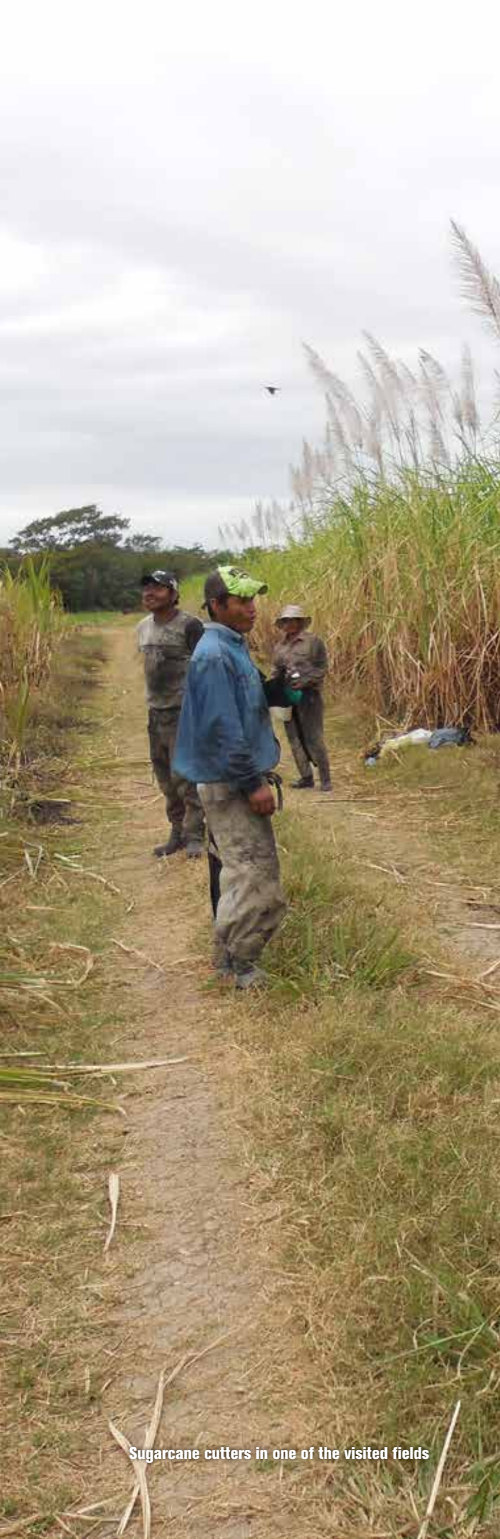
Sugarcane cutters in one of the visited fields