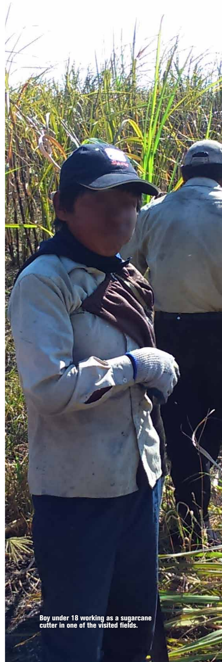
Boy under 18 working as a sugarcane cutter in one of the visited fields.

At the Sugarcane Growers’ Federation, they indicated that the 2013 harvest hired 9,200 sugarcane cutters and during the 2014 season, this figure fell to 8,700 sugarcane cutters. This is an indication that mechanization is increasing its participation in the sugarcane harvest in the Department of Santa Cruz.