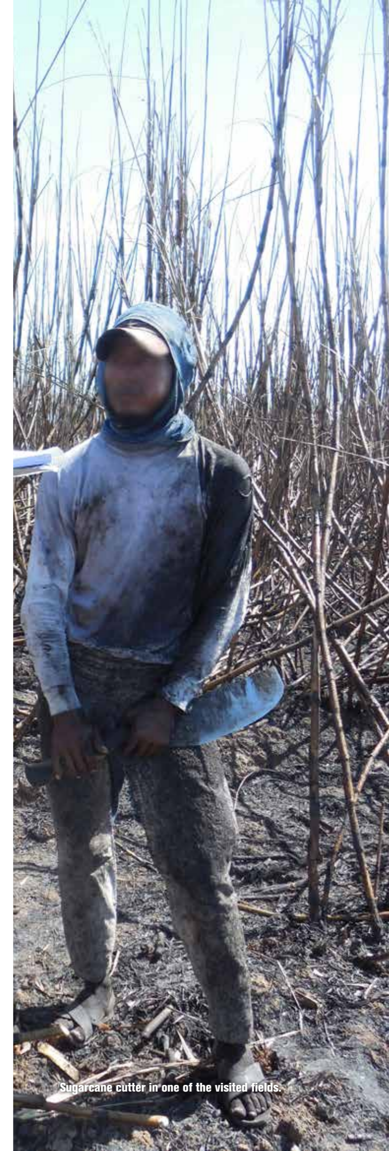
Sugarcane cutter in one of the visited fields.

Finally, the degree of commitment and concrete action of mills, mainly from mill A, should be noted, although both mills work to reduce child and forced labor among their sugarcane suppliers.