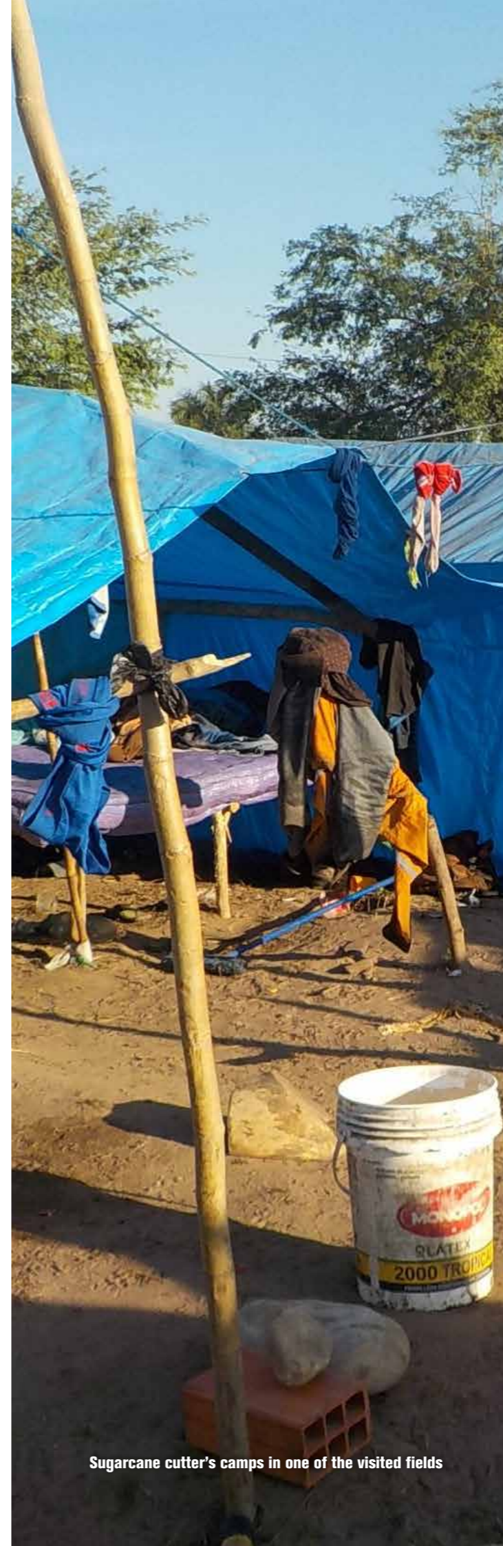
Sugarcane cutter's camps in one of the visited fields