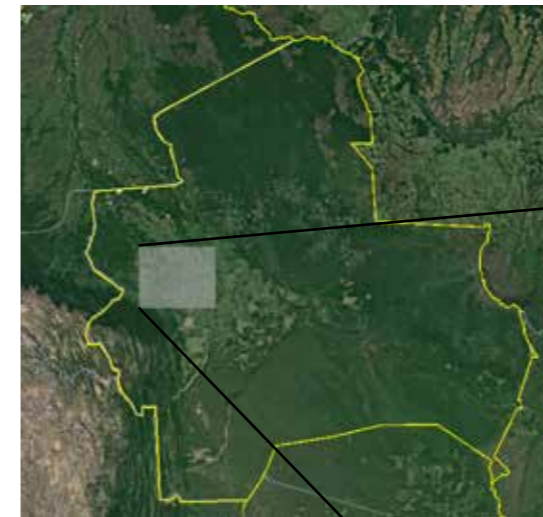
Map 1: GAP Consultores study area in the Department of Santa Cruz.

During the field visits to the mills and sugarcane growers, the policies and actions of the