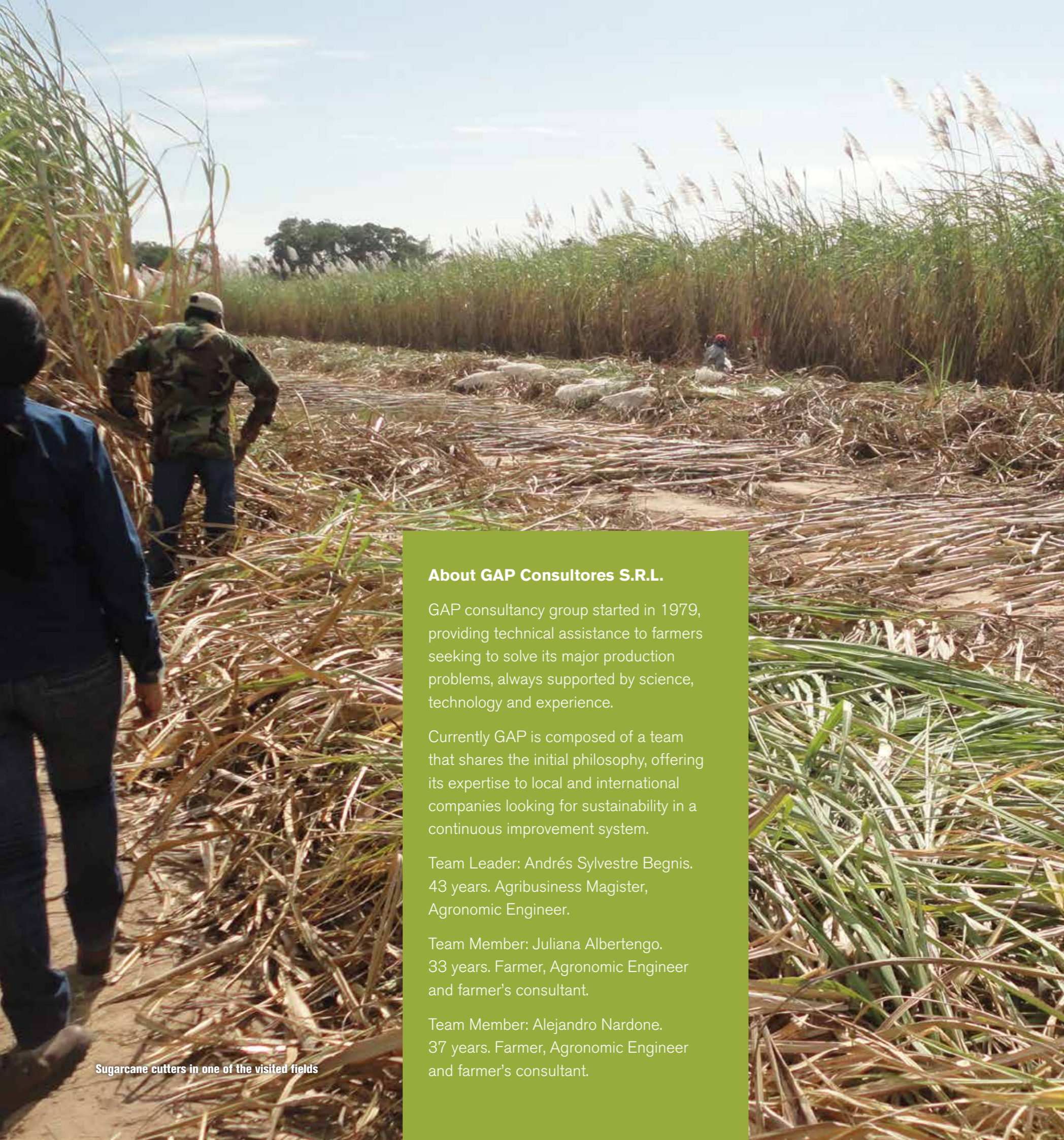
Sugarcane cutters in one of the visited fields