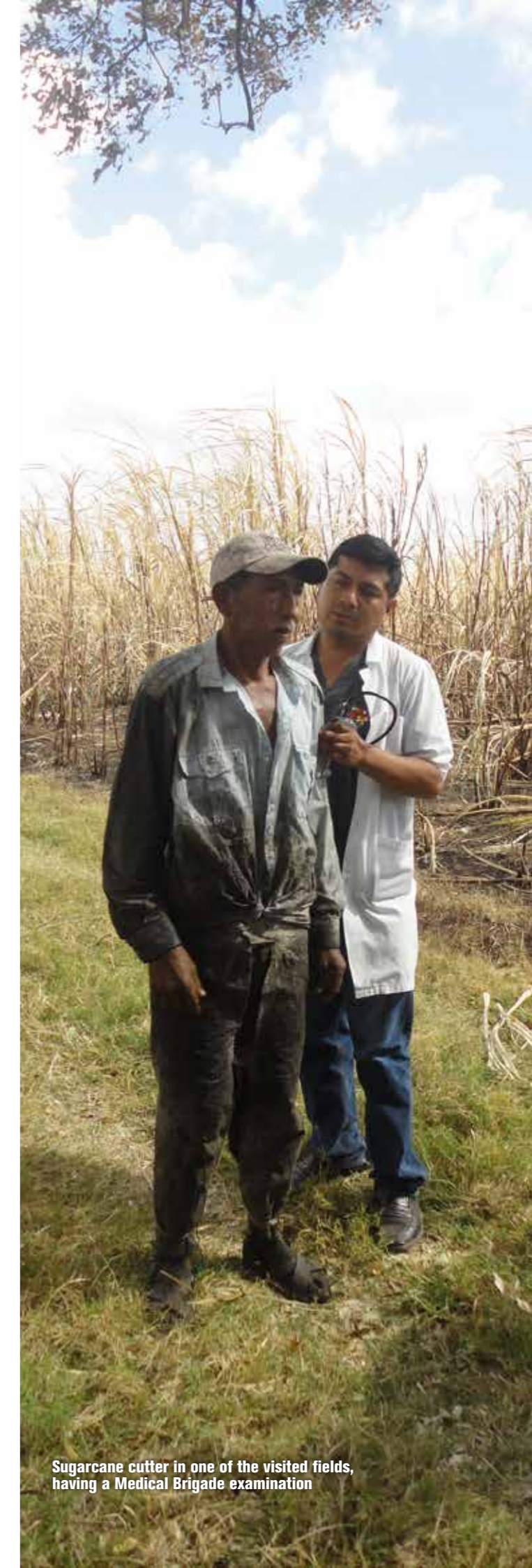
Sugarcane cutter in one of the visited fields, having a Medical Brigade examination

Annex II provides the consultants’ Interview material developed for this study and Annex III provides a detailed list of the organizations contacted (stakeholders).