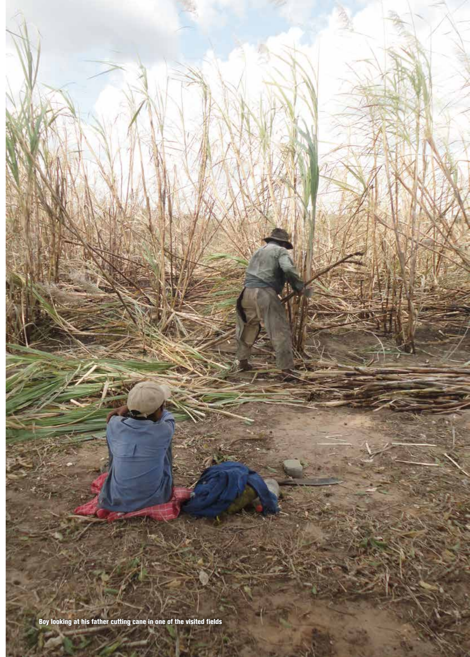
Boy looking at his father cutting cane in one of the visited fields