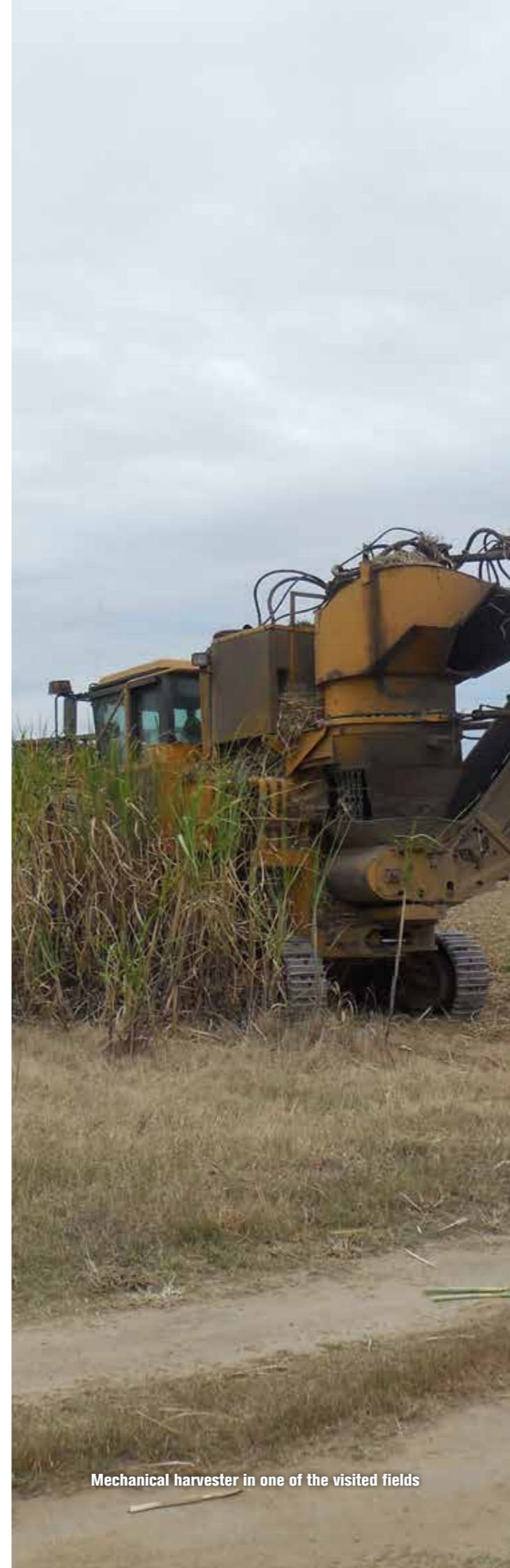
Mechanical harvester in one of the visited fields

Annex IV provides the Selection table of visited sugarcane growers.