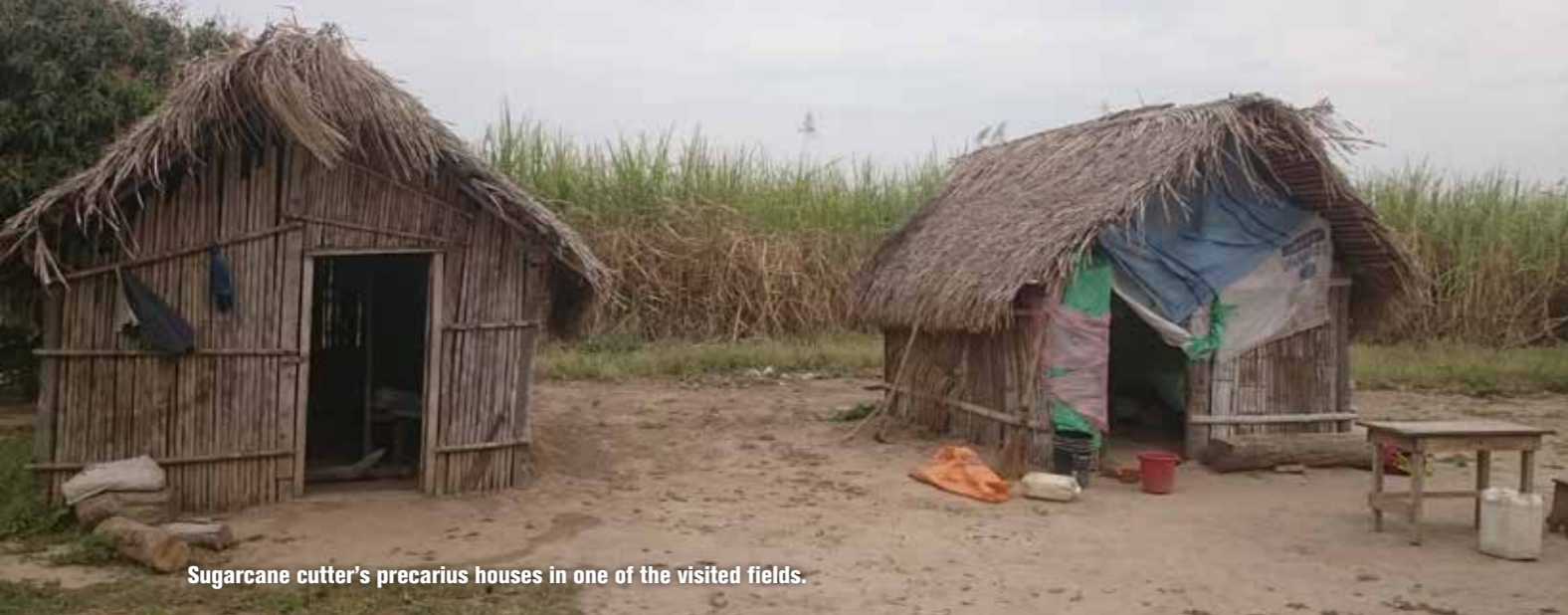
Sugarcane cutter's precarious houses in one of the visited fields.