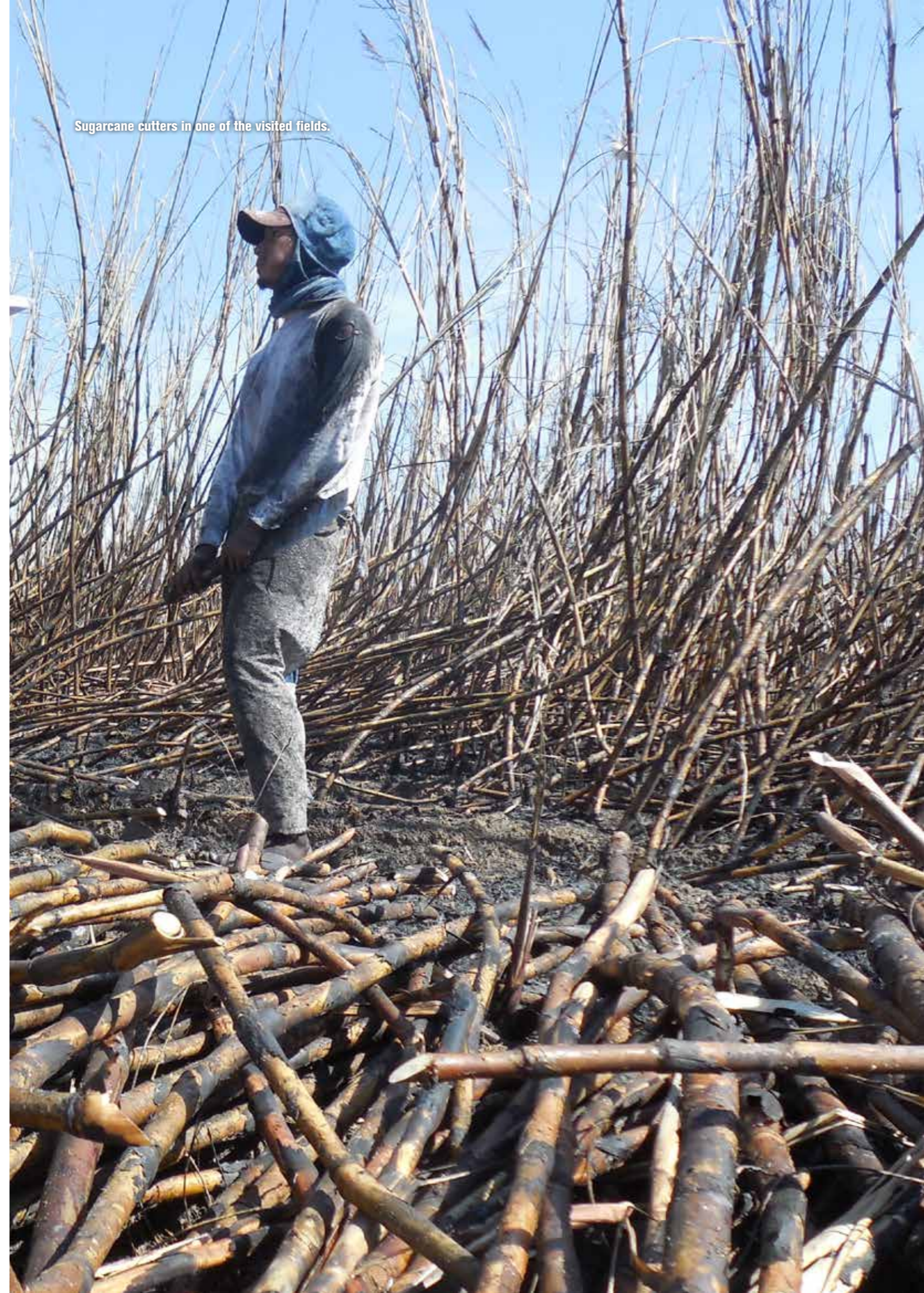
Sugarcane cutters in one of the visited fields.

25th July, 2017. Final report with sugar mills feedback.