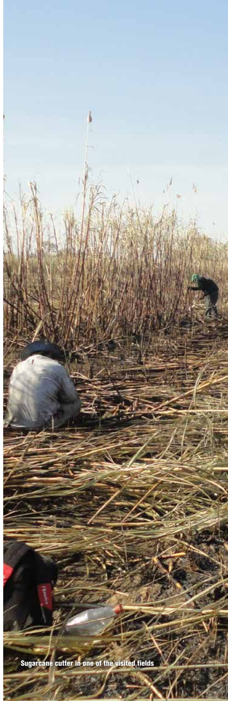
Sugarcane cutter in one of the visited fields

Most of the workers surveyed declared they had not signed any contract, even when this is a legal obligation for both temporary (sugarcane cutters or journeymen) and permanent staff.