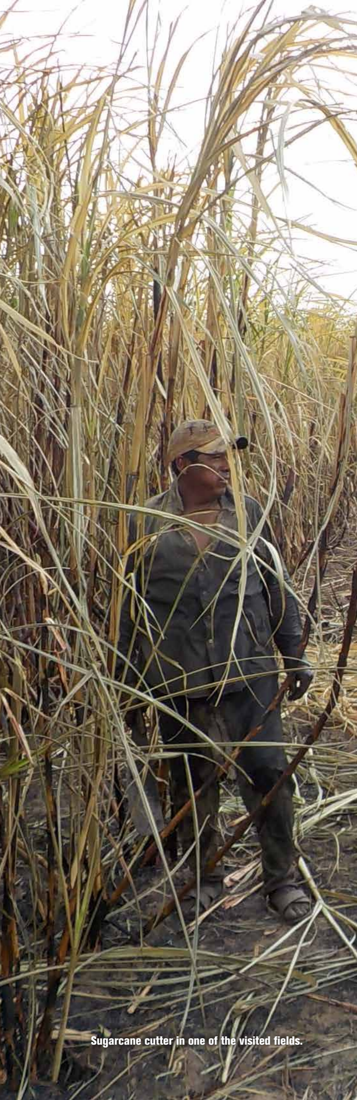
Sugarcane cutter in one of the visited fields.