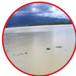
Improved farming techniques are designed to reduce erosion and use of chemicals around the San Jacinto reservoir