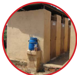
Hygienic use of new latrines is a result of strategic information, education, and communication supported by WADA

COUNTRY: Mali START DATE: November 2005 FUNDING: $560,000 - WADA