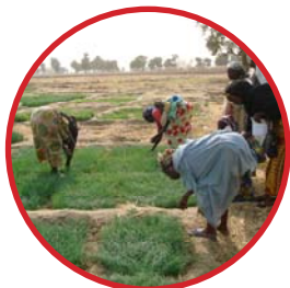
Community members of the Women Farmers Advancement Network (WOFAN) are being educated on sustainable irrigation practices through WADA activities

COUNTRY: Nigeria START DATE: September 2007 FUNDING: $500,000 – WADA