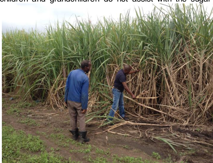
Picture: 1 70-year old Small Scale grower, KwaZulu-Natal

A 70-year old man was interviewed in the South Coast of KwaZulu-Natal and explained that his children and his neighbours' children and even grandchildren are not interested in farming. When he started farming, he used oxen to plough the earth, then he bought a tractor in 1984 and provided services to the neighbouring farmers. Due to civil unrest and conflict, he stopped this in 1994 and has since employed subcontractors to prepare the fields and harvest sugarcane. These small-scale farmers are not known to employ family members or coerce family members to work on the farms.