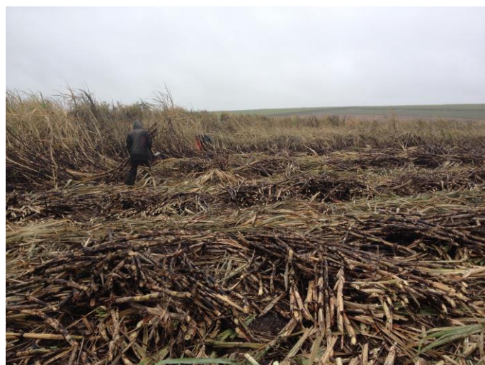
Picture: 2 Cane Cutters, KwaZulu-Natal

Subcontracting labour for cane cutting in particular is a common strategy to externalise labour. The majority of cane cutters employed in the South African sugar industry are also migrant workers: many are isiXhosa speaking from Transkei, Sotho speaking from Matatiele and Lesotho, Shangan speaking from Mozambique, and a few workers come from Zimbabwe and Malawi. In many interviews, farm managers explained how difficult it is to find local labour to cut cane. In northern KwaZulu-Natal, the Department of Labour insisted that farmers employ local labour. Obliging, Tongaat Hullett agricultural operations hosted an open day to attract local labour. Approximately 130 locals attended